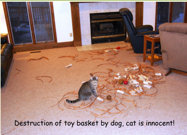
Destruction of toy basket by dog, cat is innocent!